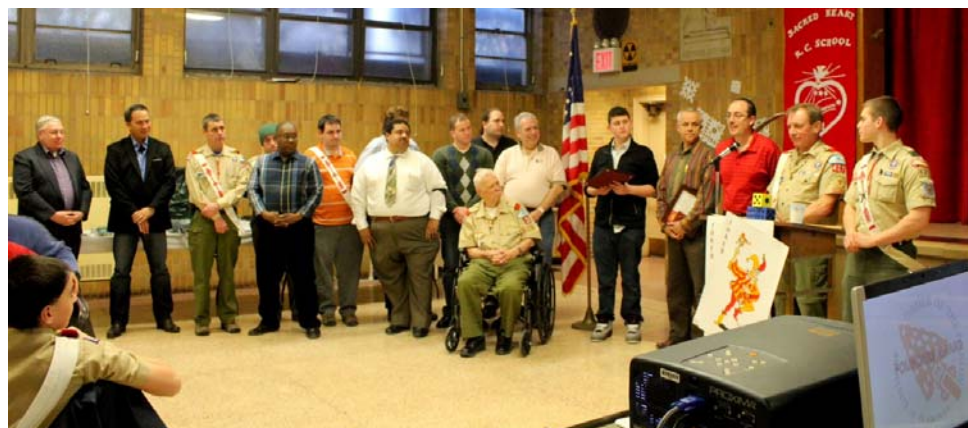
The largest gathering of Founders award recipients we've seen in years.